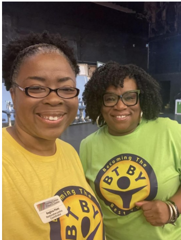
Feb. 21st : Topeka High School Assembly