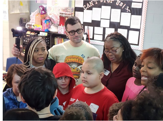
Feb. 14th : Ross Elementary #BTBY ^

On February 14th, TCPJ hosted #BTBY at Ross Elementary serving approximately 100 fifth grade students. Students remained engaged with presenters as they were challenged to think deeply and communicate from their hearts.