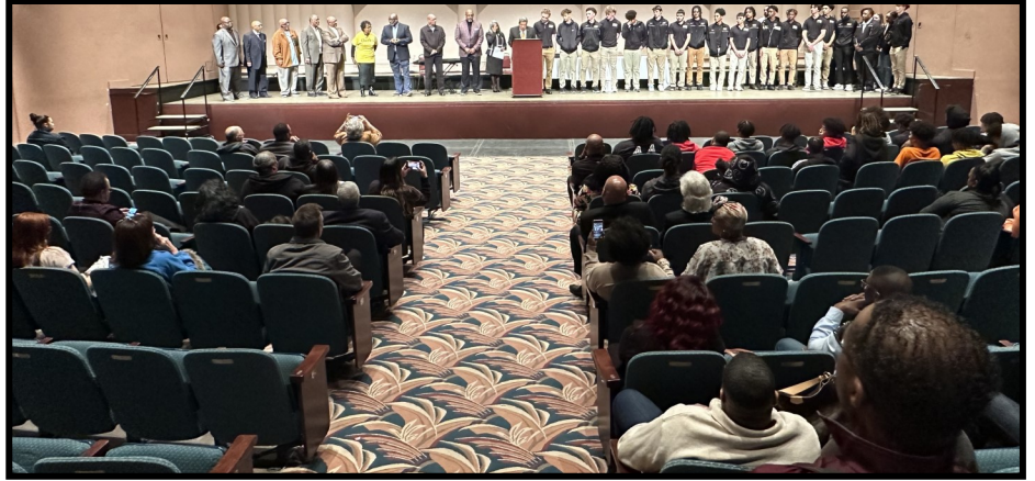
Right: Topeka High School basketball team recognition